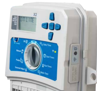
WAND Module installed in the X2 controller