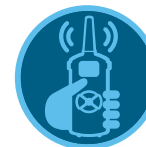
ROAM Remote ROAM XL Remote