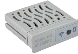
WAND Wi-Fi Module Height: ¾" Width: 2½" Depth: 2½"